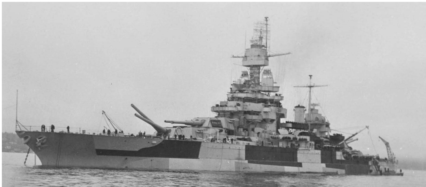
Above photo: USS Colorado - Puget Sound Navy Yard, 25 April 1944; bow view, port side.

Steven Leek 1518 N.E. Perkins Way Shoreline, WA 98155 206-367-2518 sleek1234@comcast.net