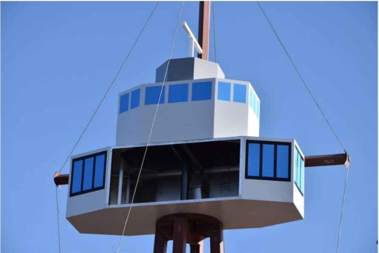
Two construction workers with a cherry picker placed the silver box on the mast. It's a time capsule of history.