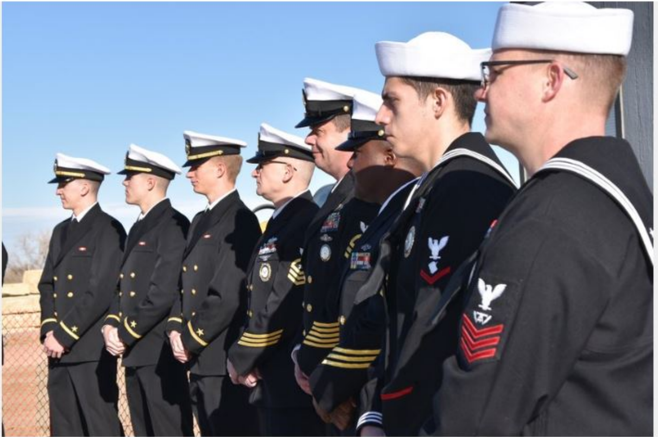
Colorado Navy soldiers came in honor of the stepping mast ceremony.